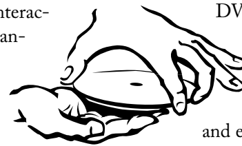
The toolbox includes a DVD and workbook.